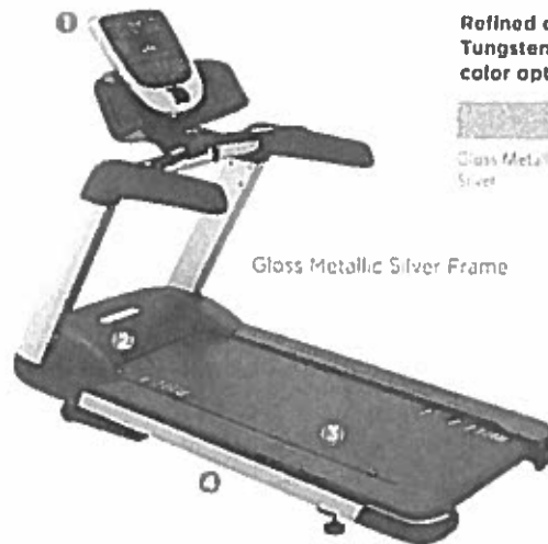
Gloss Metallic Silver Frame

Our patented GFX system combines ideal cushioning, support, and stability for the exerciser's. Precor decks are designed to provide more absorption in the front where the exercisers' feet hit the belt and added rigidity at the back for a firm push-off.