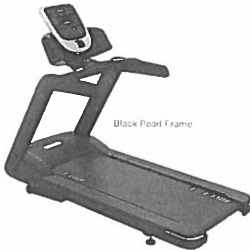
Black Pearl Frame

Refined colorways with dark Tungsten covers and two frame color options.