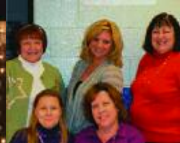
First Commonwealth Bank