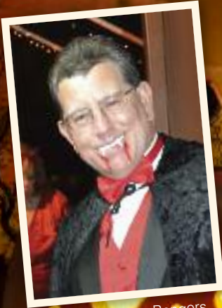
Mayor Thomas Rengers