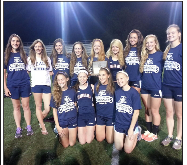
Girls Track Seniors