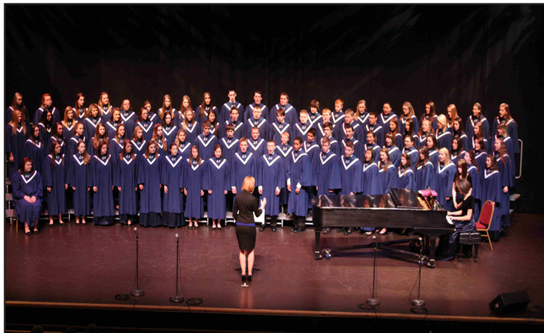
Shaler Area Concert Choir competes