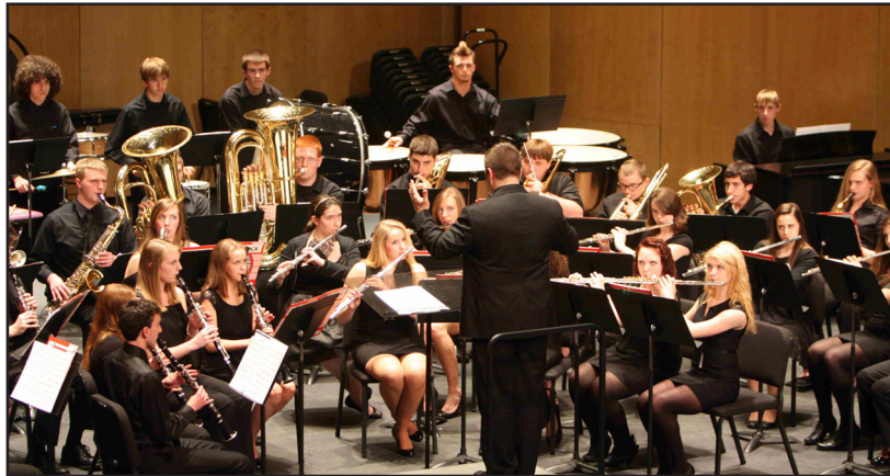
Shaler Area Wind Ensemble competes

Their hard work paid off during the competi-